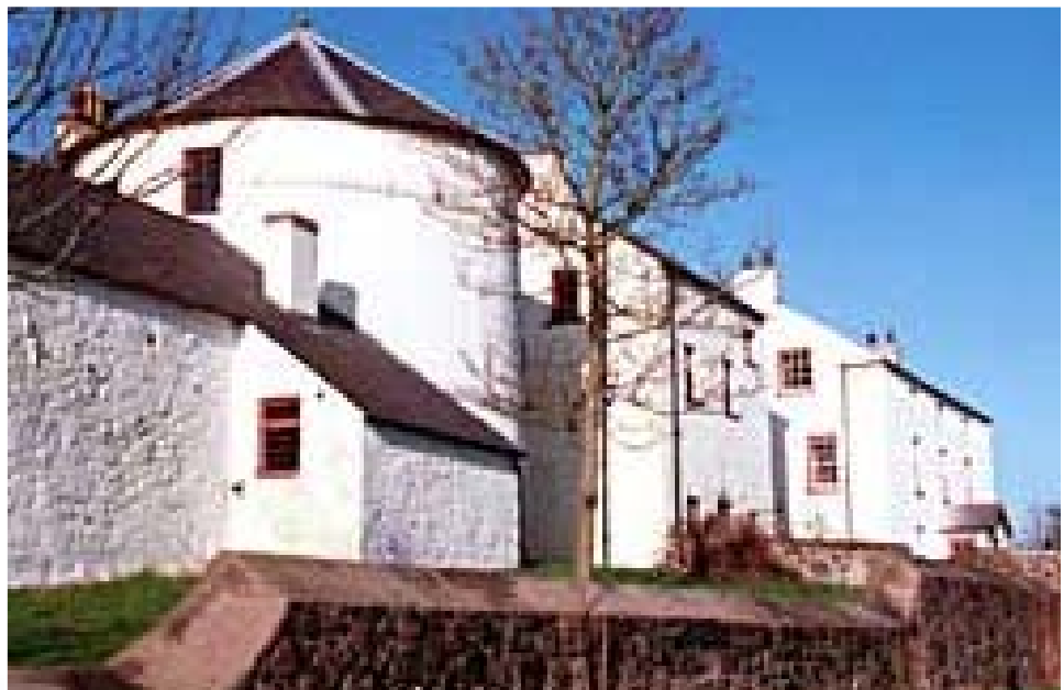
Bellaghy Bawn today

This bawn was built around 1614 to protect the lands granted to the Vinters Company of London. It was built as a square with a brick tower situated in one corner. Unfortunately the original bawn was burnt down during the 1641 rebellion but was rebuilt in 1643 and the entire bawn has been reconstructed so that today it is used as a cultural centre with a library dedicated to Seamus Heaney.