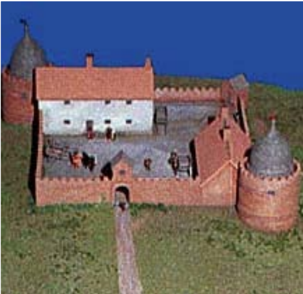
Model of a bawn

Perhaps the most famous one in Ulster today is Bellaghy Bawn, associated with the Nobel Prize-winning poet, Seamus Heaney. It is in County Londonderry.