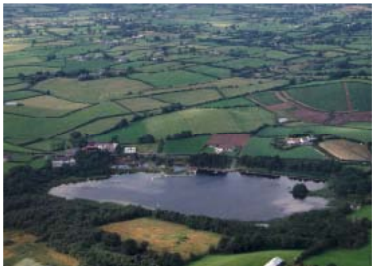
County Down from the air—see the patchwork effect